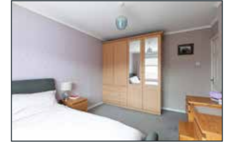
BEDROOM (1): 12' 7" x 10' 1" (3.84m x 3.07m)