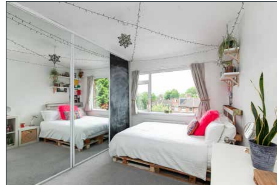
BEDROOM (2): 12' 5" x 8' 6" (3.78m x 2.59m)