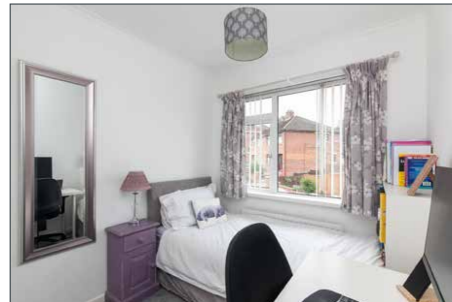
BEDROOM (3): 7' 5" x 6' 10" (2.26m x 2.08m)