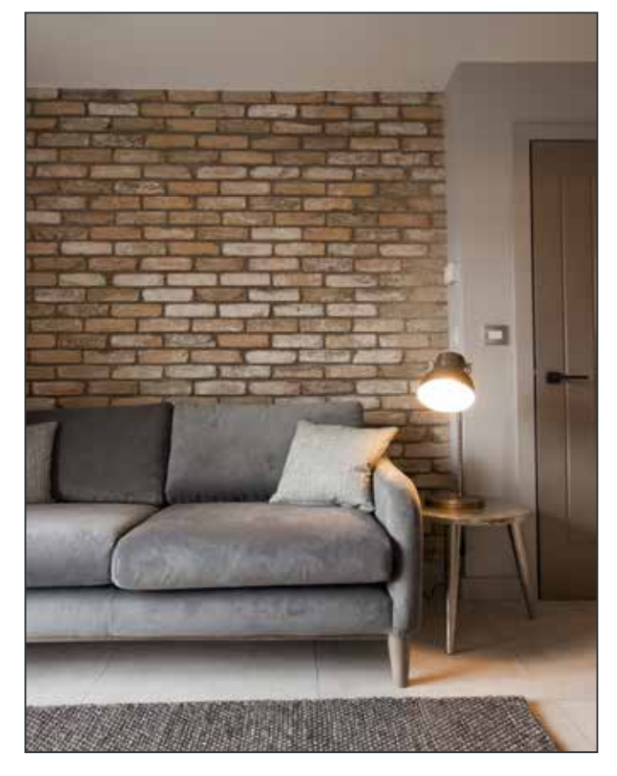
LIVING / KITCHEN / DINING AREAS