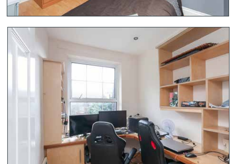
BEDROOM (4): 7' 0" x 6' 3" (2.13m x 1.91m)