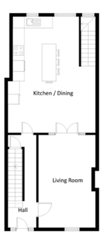
2 Windsor Court, Belfast (1st Floor) Plans for illustrative Purposes Only

Telephone 02890 668888 www.simonbrien.com