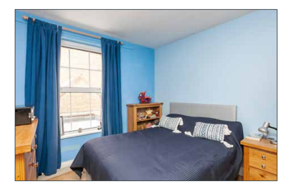
BEDROOM (2): 10' 7" x 9' 8" (3.23m x 2.95m) Built in wardrobes.