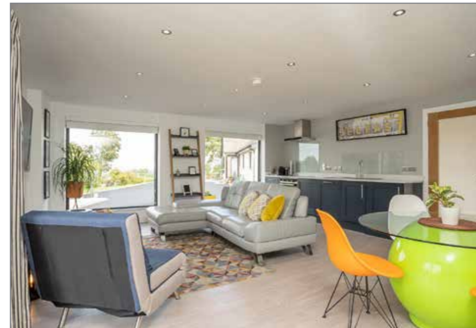
KITCHEN/LIVING/DINING: 18' 8" x 16' 9" (5.69m x 5.11m) High and Low Level units, inset sink, 4 ring hob, ove, fridge and washing machine