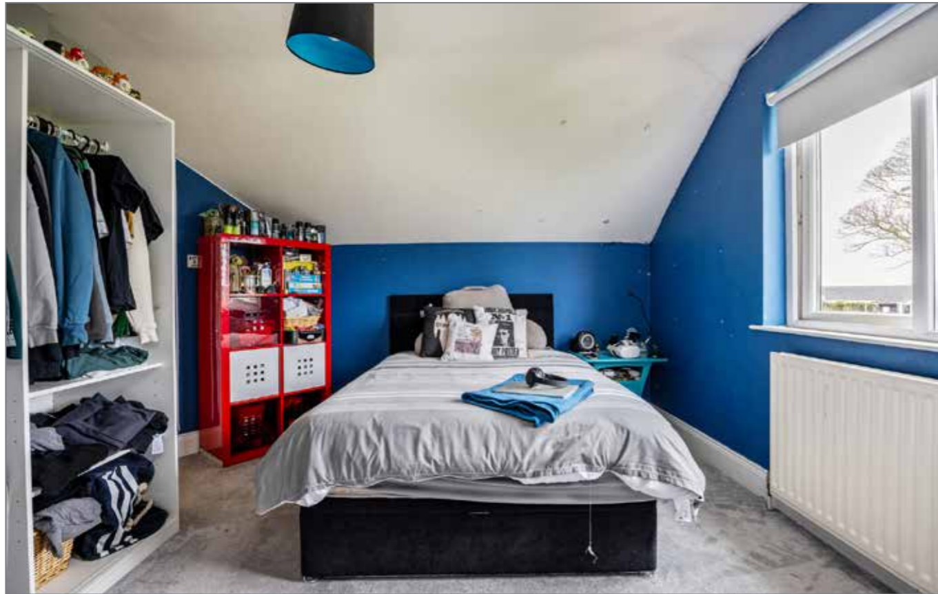
BEDROOM (5): 13' 5" x 11' 7" (4.09m x 3.53m)