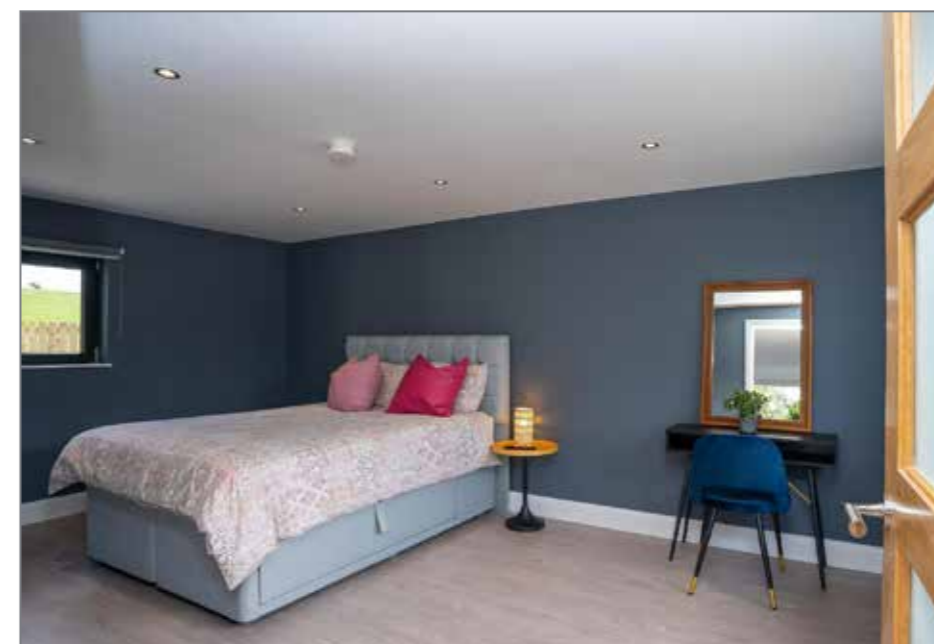
BEDROOM (1): 17' 1" x 10' 7" (5.21m x 3.23m) STORE: 14' 2" x 7' 6" (4.32m x 2.29m) SHOWER ROOM: