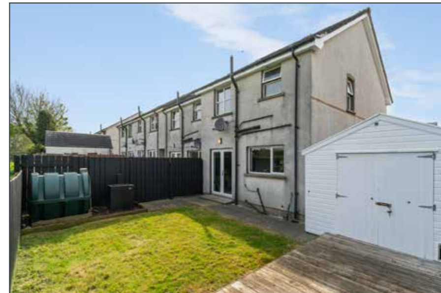
OUTSIDE Gardens to front and rear in lawn, to rear in enclosed relatively private garden laid out in lawn paved patio area, fencing, oil fired boiler house, oil fired boiler, oil storage tank, feature raised timber decking.