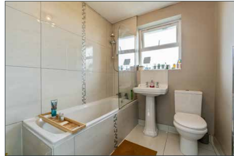
DELUXE BATHROOM: White suite comprising: Panelled bath with Mira Sport thermostatically controlled shower over, bath, glass shower screen, pedestal wash and basin, push button WC, chrome towel radiator, feature wall and floor tiling, extractor fan.