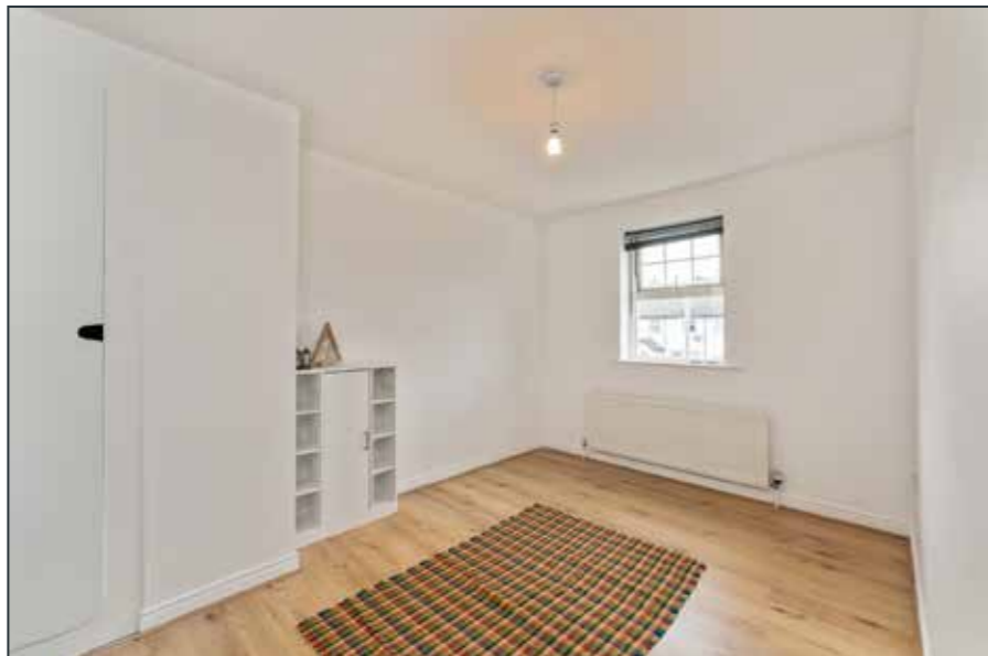
BEDROOM (2): 12' 10" x 8' 11" (3.91m x 2.72m) Polished laminate floor, built in robe.