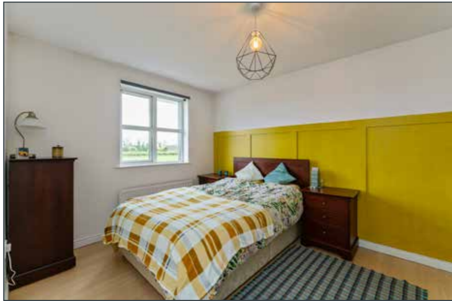
BEDROOM (1): 14' 2" x 9' 5" (4.32m x 2.87m) Polished laminate floor, roofspace access, countryside views.