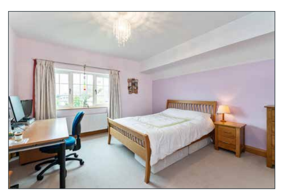
BEDROOM (2): 14' 0" x 13' 2" (4.27m x 4.01m) Built in robe.