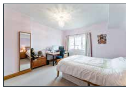
BEDROOM (3): 15' 9" x 9' 9" (4.8m x 2.97m)