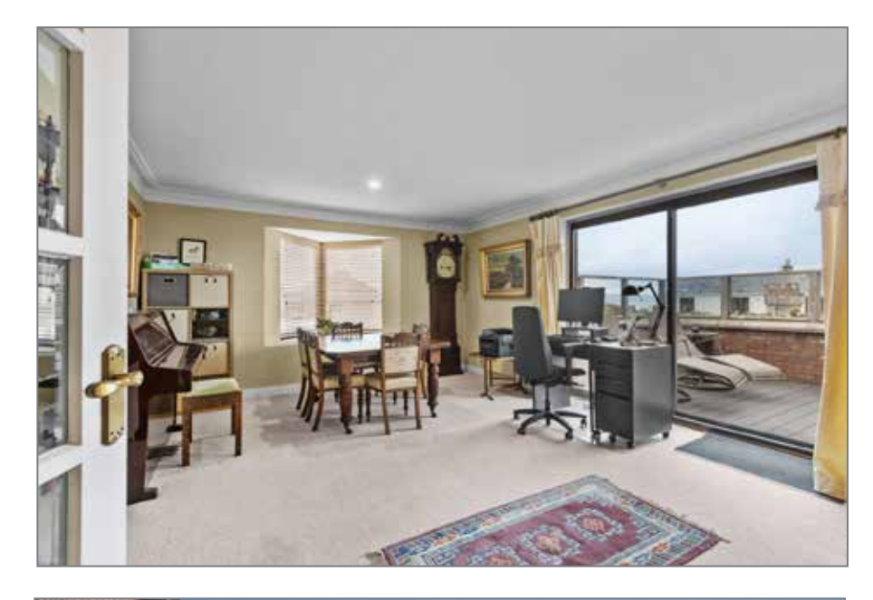
DINING ROOM: 18' 4" x 13' 5" (5.59m x 4.09m)

Oriel bay. Corniced ceiling, sliding patio door to Balcony Terrace.